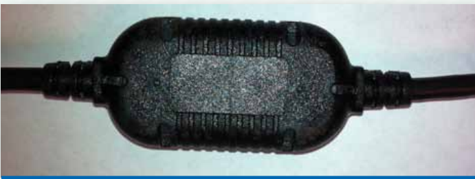
Figure 2, Modified Cable Signal Amplifier

Figure 2 below shows the signal amplifier fitted with strengthened black casing for added protection. When in use, the vents are illuminated by red light.