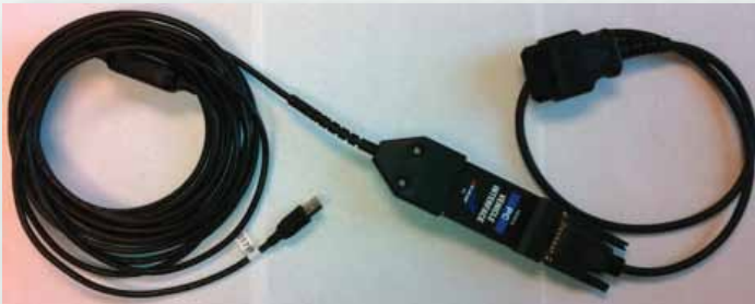
Figure 1, Clamshell Assembly

Figure 1 below shows the fully assembled clamshell kit.