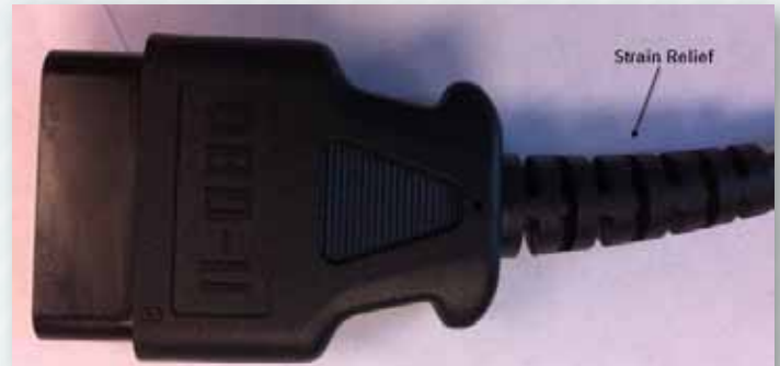
Figure 4, Lengthened Strain Relief on OBD-II Cable

Strain relief is lengthened on the OBD-II connector cable as shown in Figure 4 below.